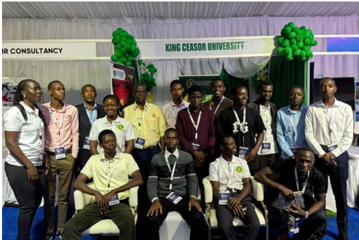
King Ceasor University staff and students at the Oil & Gas Expo