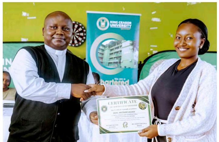
Profound moment as student is awarded a certificate by the Dean of Students