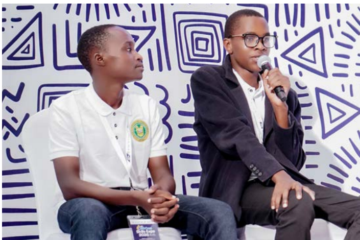
Students actively participating in an engaging academic quiz session.