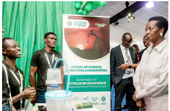
Showcasing innovation skills and future-ready solutions at the Oil & Gas Expo 2026