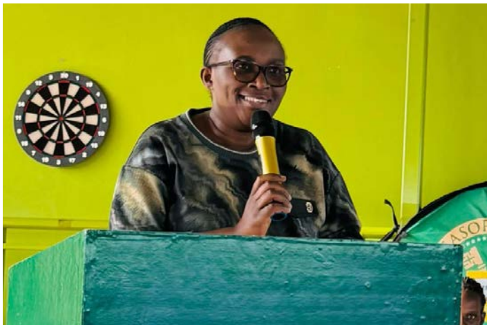
Vice Chancellor addressing students on discipline and academic focus